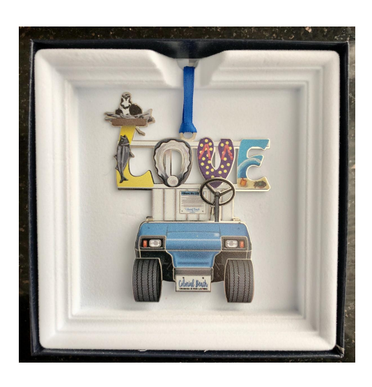
LOVE Golf Cart Ornaments are sold at the Colonial Buzz

Don't forget your Building Community Raffle ticket since you'll be at the Beach Music Festival when the winning ticket is drawn. You could leave the festival $5,000 richer. See graphic below.