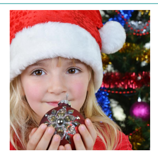
CB Kids Christmas Sponsored by CB Kids & BAMM (Foundation Community Partners)

If you like to run and drink beer (or root beer), the Beach to Beer 5K & 10K is for you. If walking or jogging is more your style, an optional Walk/Fun Run is available. Learn more and register here .